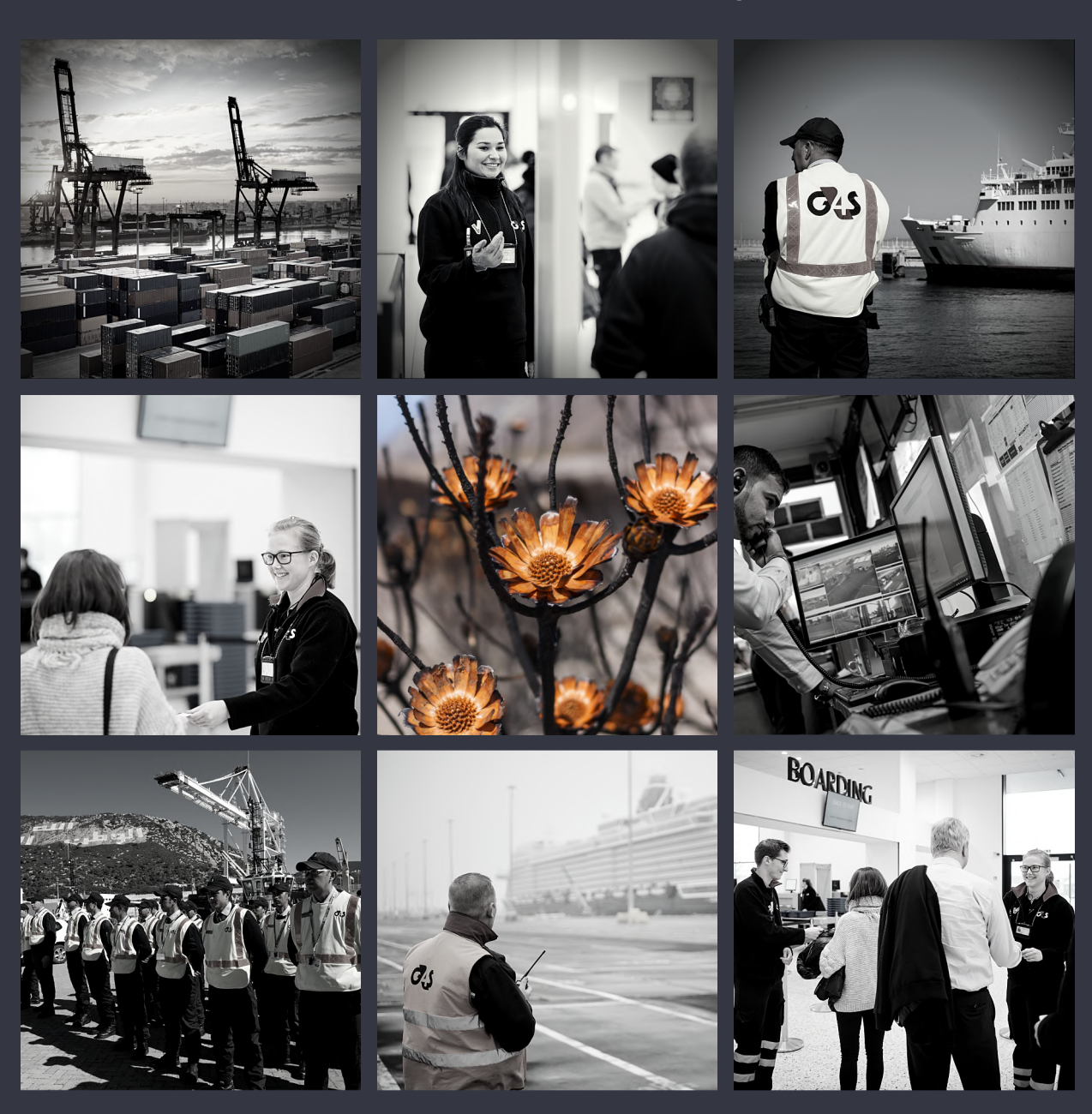
Responding - Adapting - Evolving