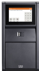
Touch Pro V (5 keys)

Touch Pro is our most secure and sustainable cabinet to date and is available in four different sizes, managing anywhere from 5 to 720 keys.