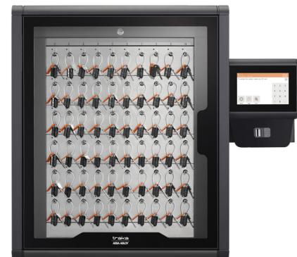
Touch Pro S (up to 480* keys)