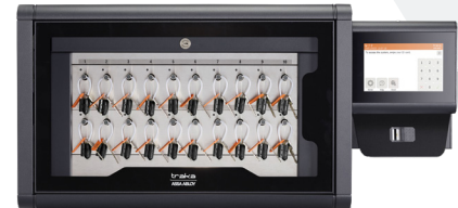
Touch Pro M (up to 40 keys)