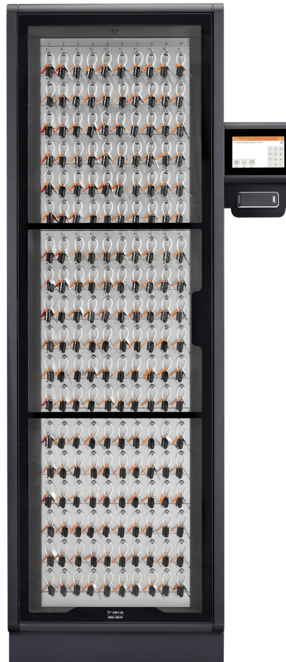
Touch Pro L (up to 720* keys)