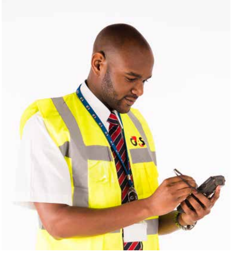
As an ISO-registered company, we integrate our quality management system (QMS) processes and procedures with each quality control plan (QCP) we develop.