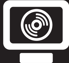
Software & Technology